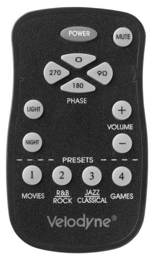
Figure 3. Remote Display

Figure 3 shows the remote control, enabling you to easily choose whatever listening mode you desire.